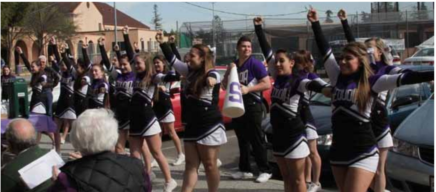
Cheerleaders burst with Sequoia Pride.