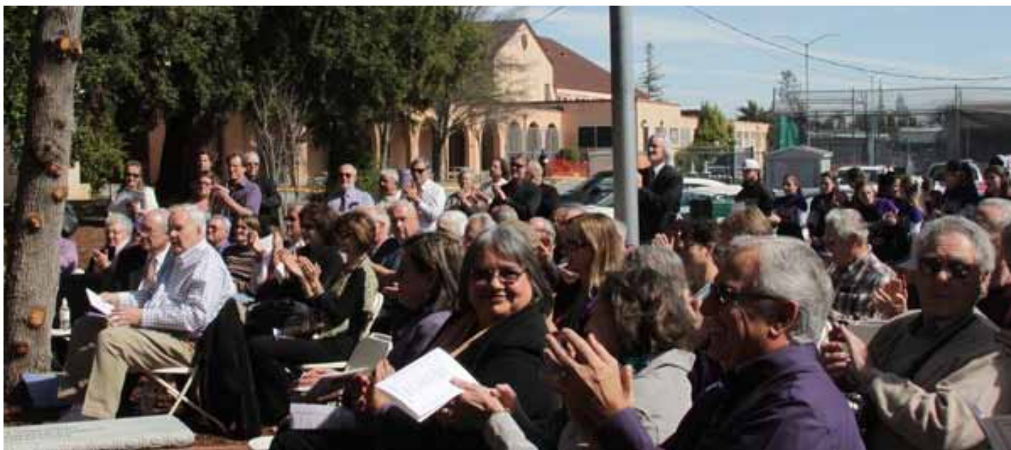
Large crowd gathered for the ceremony.