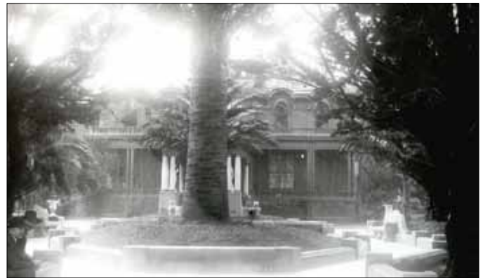
Front yard of the Dingee Estate (1905). Cement magnate William Dingee owned the property where Sequoia High School now stands. He built a beautiful home and improved the landscaping of the estate. The home was destroyed in the 1906 earthquake and Dingee was forced to sell the property. The concrete curbs, benches, and old fish pond (now a planter) are still part of the campus.